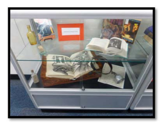
Items from OU Libraries Special Collections.