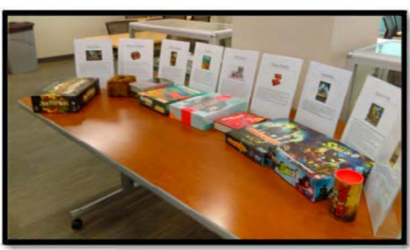
Medical & Monster Board Games.

It only seemed fitting to plan a program on Friday, April 13 for a Frankenstein event series and provide a more light-hearted activity among the formal programs. We offered a three-hour open board game night featuring medical and monster-themed board games followed by a film screening of the original 1931 film of Frankenstein, featuring the now iconic portrayal by Boris Karloff. The board games were mostly from personal collections, but the medical library purchased four games to start an educational board game collection for our medical students.