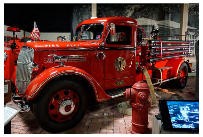
1938 Bainbridge Fire Company REO Speed Wagon

On Thursday, I attended education sessions for Research During Residency and Electronic Resource Licensing. The panel discussion about Digital Knowledge Infrastructure was especially relevant, as I am currently designing a new library home page. We will be switching discovery tools from Primo to EDS (EBSCO Discovery Service), and we are currently using the Primo home page as our library's home page. I decided to use LibGuides to design a user-friendly page but received some much-needed reminders about making sure the page actually makes sense to users. Following a full day of learning, I attended the Special Event at the RE Olds Transportation Museum. We enjoyed a delicious dinner while talking and laughing about our library experiences, then spent some time learning about the founder of Oldsmobile during a scavenger hunt. Did you know that the REO Speedwagon was a fire truck?!