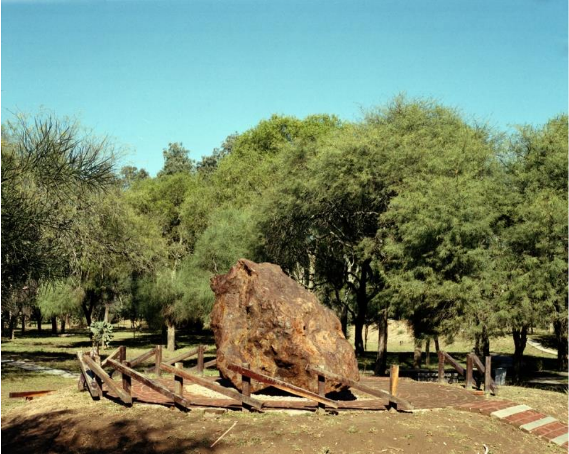
Figure 2. Promotional image of El Chaco meteorite provided by Guillermo Faivovich and Nicolas Goldberg, used with permission from the artists.