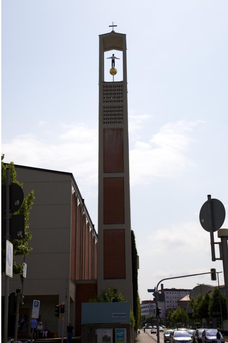
Figure 3. Man in the Tower , 2012 by Stephan Balkenhol. Public domain photograph accessed from Wikimedia Commons: https://commons.wikimedia.org/wiki/File:Sankt_Elisabeth_Kassel_documenta_13.jpg