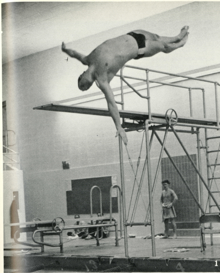
1. A backward dive is perfected off the board. 2. The swimmers have a bright future with help from backstroker.